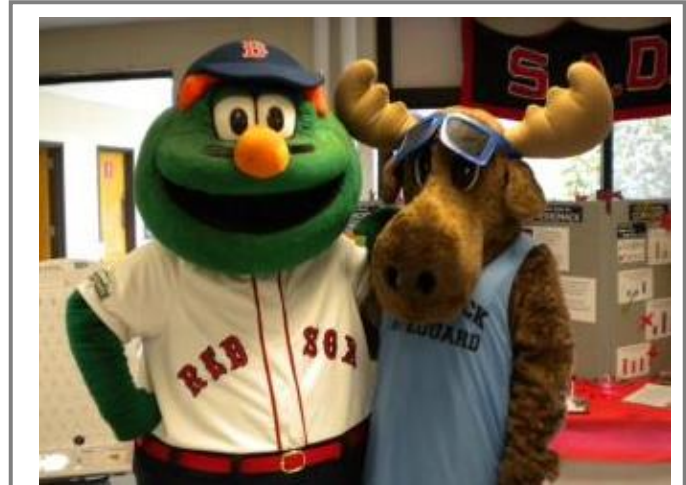
Mack the Moose and Wally the Green Monster traded substance abuse prevention tips at the Merrimack Business Expo in the fall. Thanks to the high school SADD students for donating their time to help make this event a success! Guests enjoyed Mack bookmarks and plinko trivia games.

In addition, Merrimack Police Department has been working to install a permanent drop-off box in its lobby, which will enable people to dispose of their medicines safely throughout the year, as soon as they are no longer needed. Once it's available, the drop box will further help reduce accidental overdoses, misuse and the dangerous practice of prescription sharing.